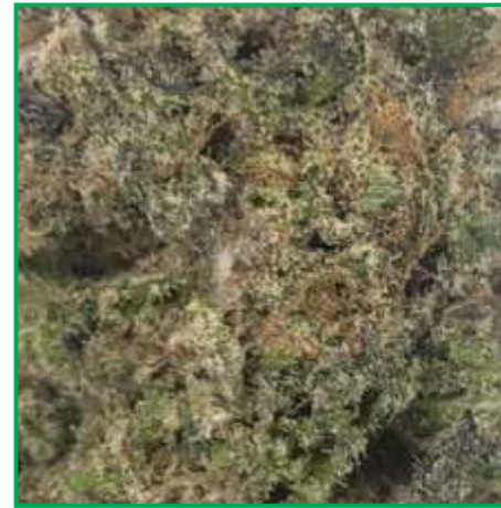
*Actual pictures from cultivation